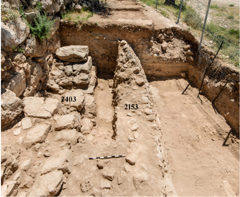
Figure 8: The supporting wall and glacis, looking east