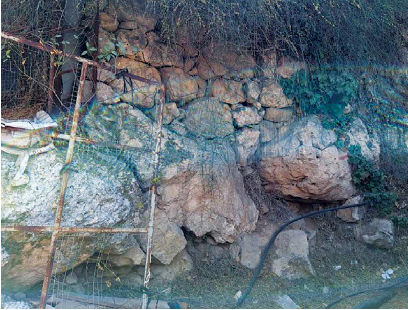
Figure 3: A segment of cyclopean wall exposed today under a modern terrace in the northern part of the tell, looking south