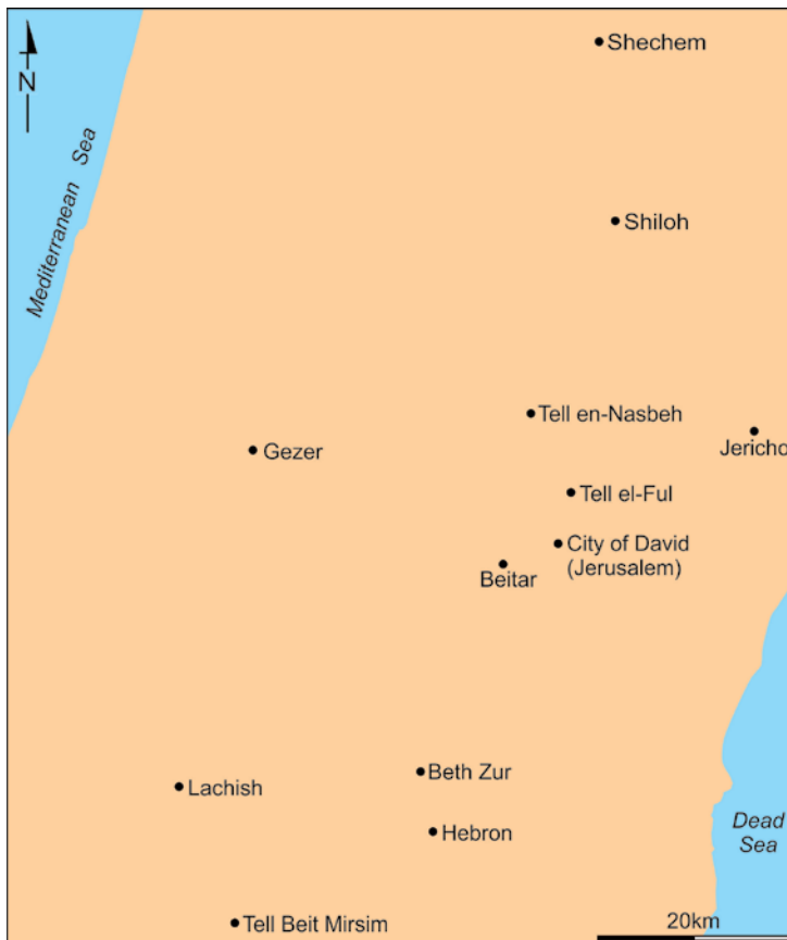
Figure 1: Map with sites mentioned in the text

Tel Hebron (Tell Rumeida), about 30 km south of Jerusalem (Fig. 1), has been accepted as the location of biblical Hebron since the 1950s. Hebron was the leading city in Judah throughout the ages, and it was the seat of David's kingdom during the first seven years of his reign.