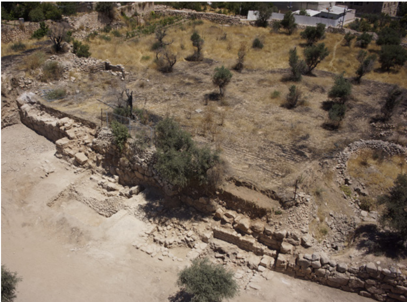
Figure 4: Tel Ḥevron – Area 53B, looking north