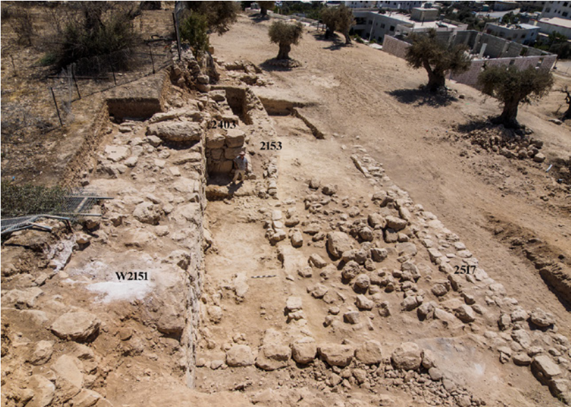
Figure 7: The cyclopean wall in Area 53B, top view looking east