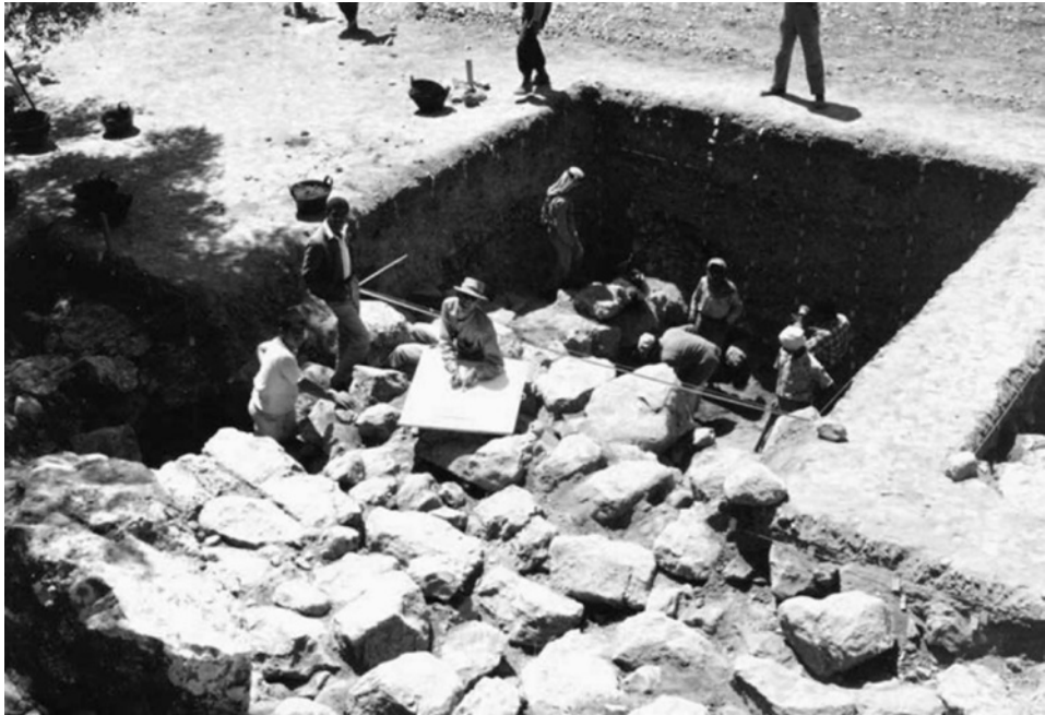
Figure 10: View of the top of the Wall 2 foundation structure in Squares I.3 and I.3A, 1964 (Chadwick 2018: Fig. 18)