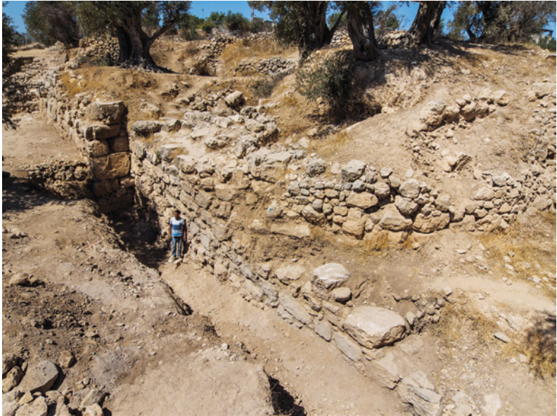
Figure 9: Wall D, looking west