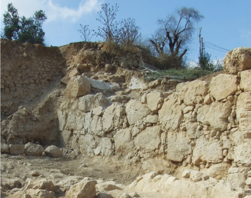
Figure 6: The cyclopean wall in Area 53B, looking north